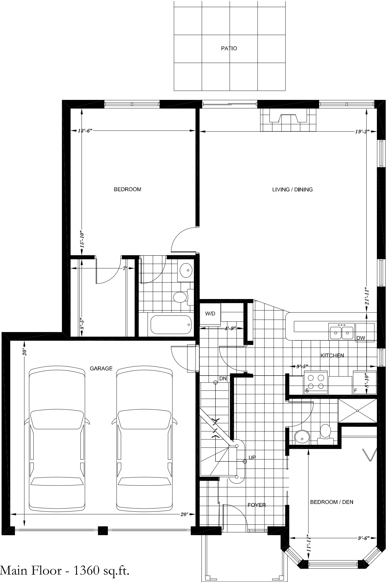
Main Floor - 1360 sq.ft.